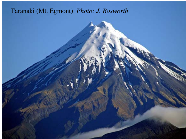
Taranaki (Mt. Egmont)

Taranaki (Mt Egmont) is the most southern of a line of older volcanoes. It began erupting 120,000 years ago with the last eruption in 1755 and it is likely to erupt again in the next 100 or so years. It is a 'classic' strato-volcano with a steep central cone surrounded by a gently sloping ring plain. It is noted for pyroclastic flows, lahars and landslides.