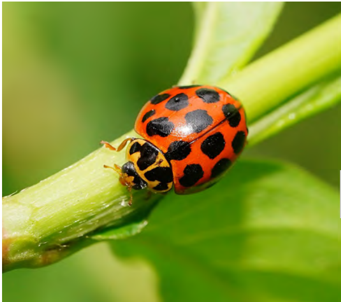
Harmonia conformis - Above: larvae and pupa Left: adult.