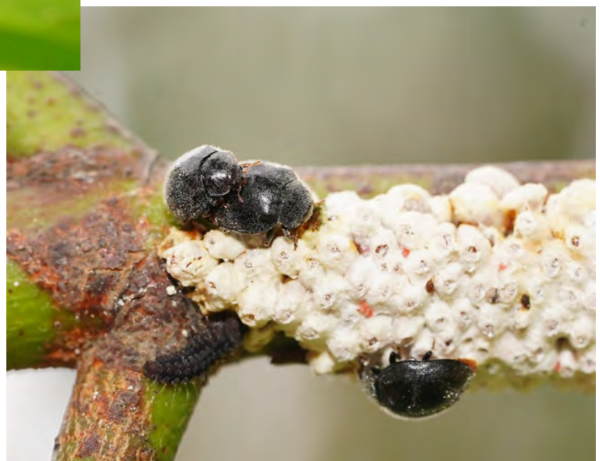
Scale-stalking Lady Beetles