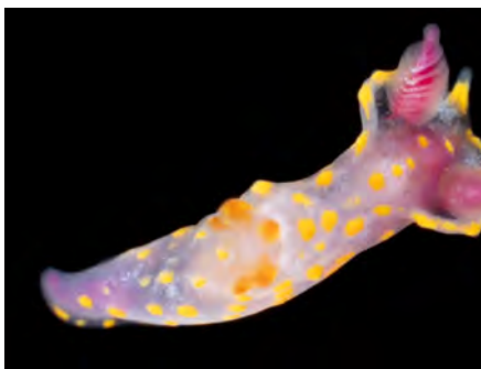
Polycera janjukia March 10th