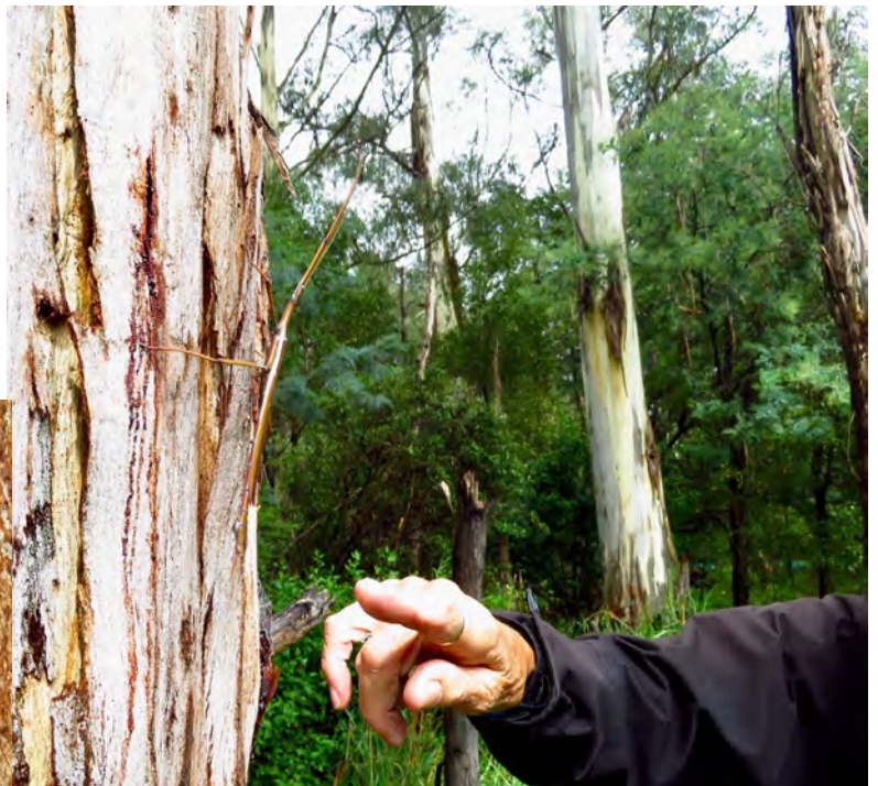
Above and left. Mantis