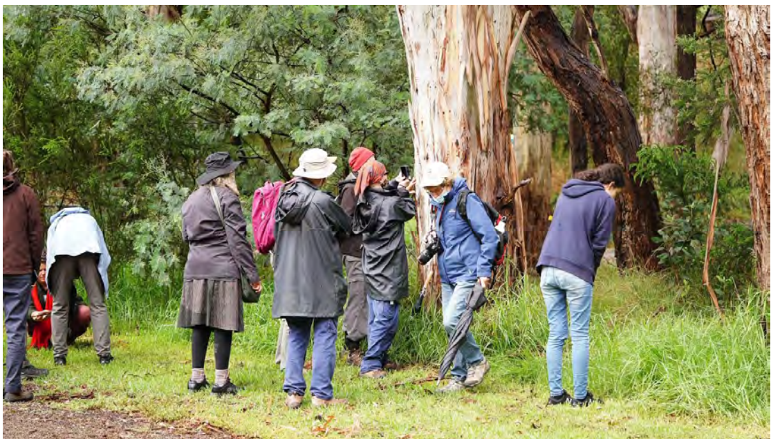
Lining up to take photos of mantis.