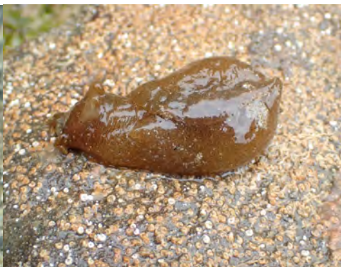
Aplysia juliana Apollo Bay Boat Harbour March 13th