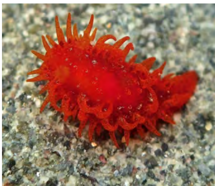
Madrella sp. Pt Bunbury, March 13th