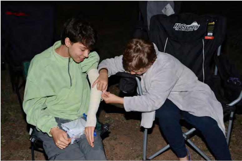
Photo 3. Pressure immobilisation bandage training victim.