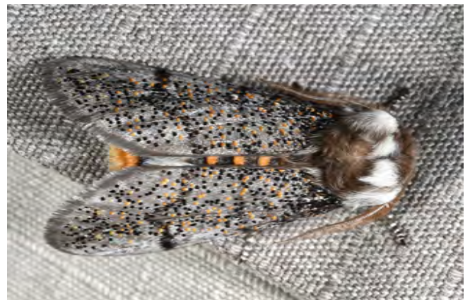
Photo 6. Oenosandra boisduvalii male Boisduval's Autumn Moth.