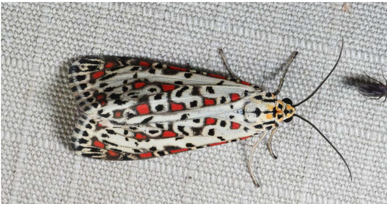
Photo 4, Utetheisa pulchelloides , Heliotrope Moth.