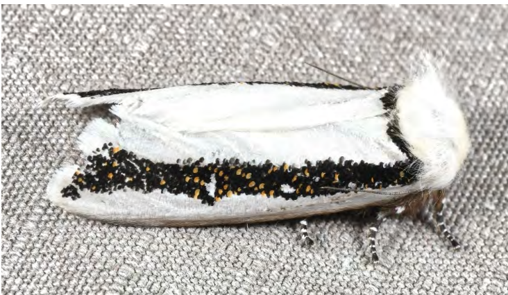
Photo 5. Oenosandra boisduvalii female Boisduval's Autumn Moth.