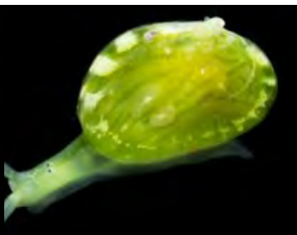
Edentellina typica March 10th