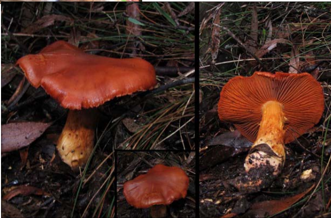
Cortinarius austrocinnabarinus

On a small branch was the funnel-shaped Black-foot Polypore Polyporus melanopus that had a very dark brown stem. Also on wood was Lentinellus pulvinulus . This species has no stem and the uneven saw-tooth gill edges seen on this genus.