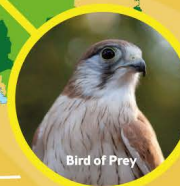
Bird of Prey