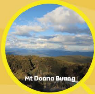
Mt Donna Buang